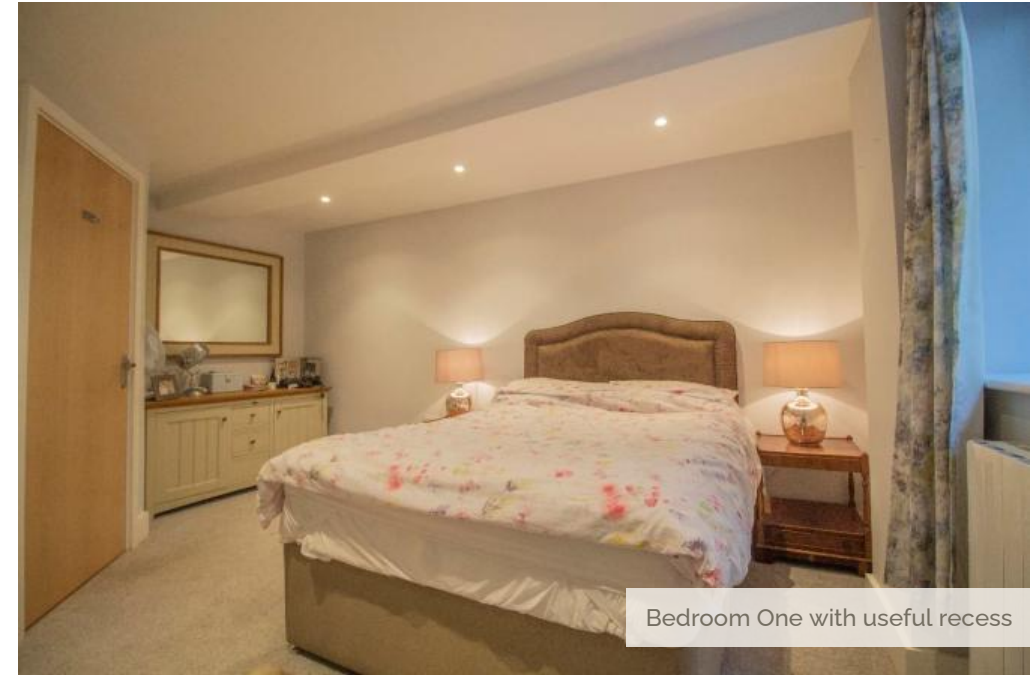
Bedroom One with useful recessed lighting

The impressive courtyard garden measuring 23'9" x 17'10" (7.24m x 5.44m) with its much larger than average proportions is covered in natural Indian sandstone paving slabs creating a great low-maintenance and entertaining outdoor space. The landscape is softened by a large pergola for growing climbing plants. Outdoor spigot and ambient lighting. There is the benefit of a separate gated entrance