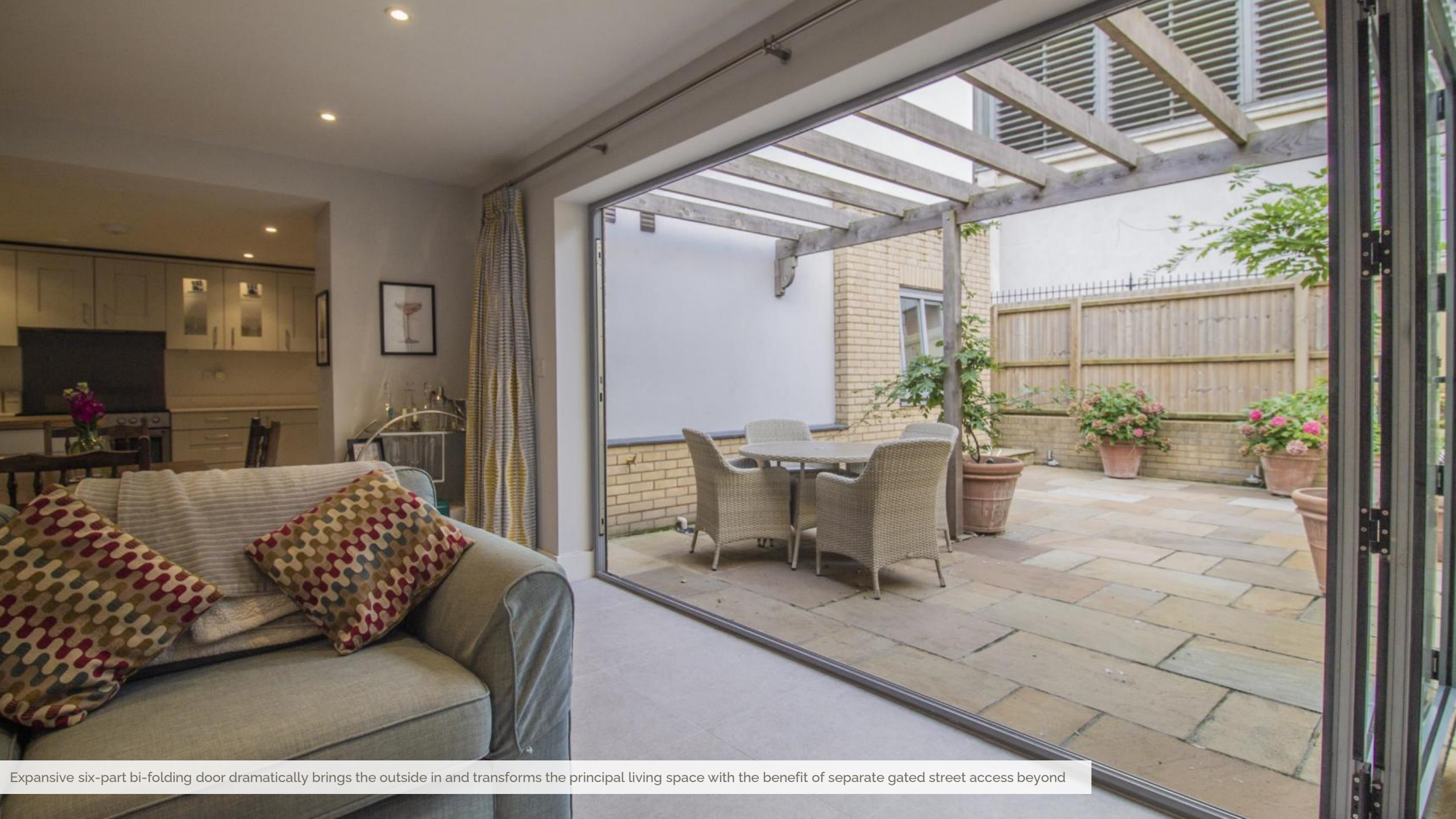
Expansive six-part bi-folding door dramatically brings the outside in and transforms the principal living space with the benefit of separate gated street access beyond