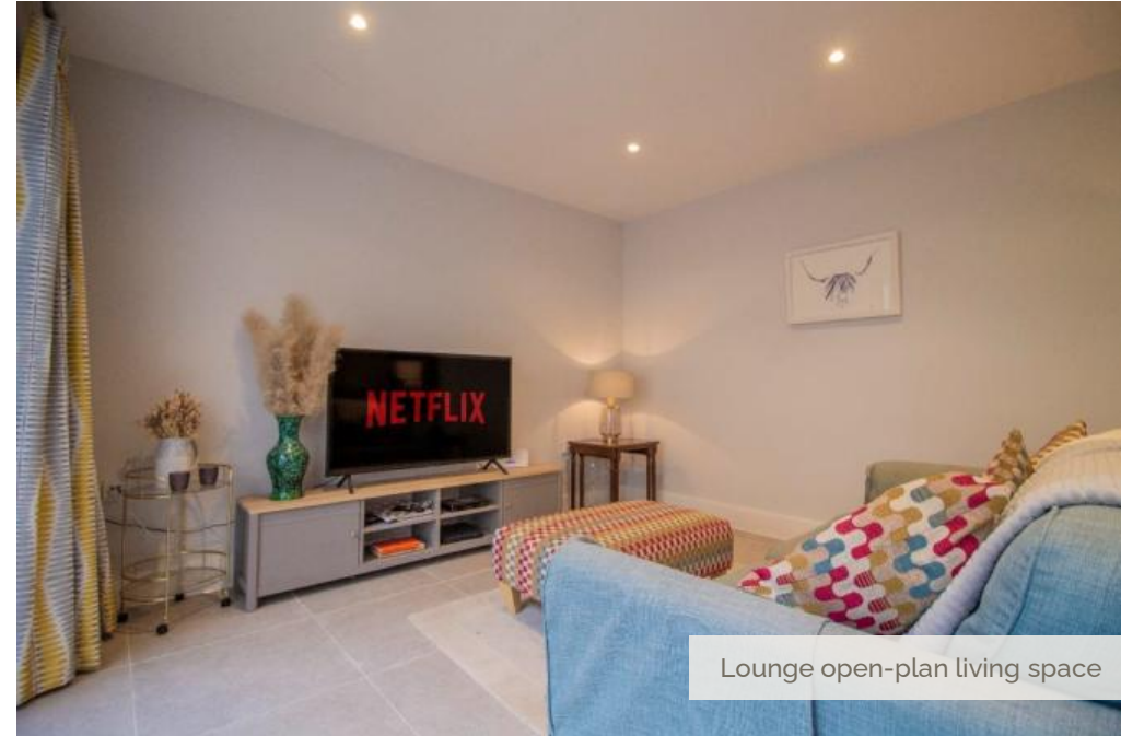
Lounge open-plan living space