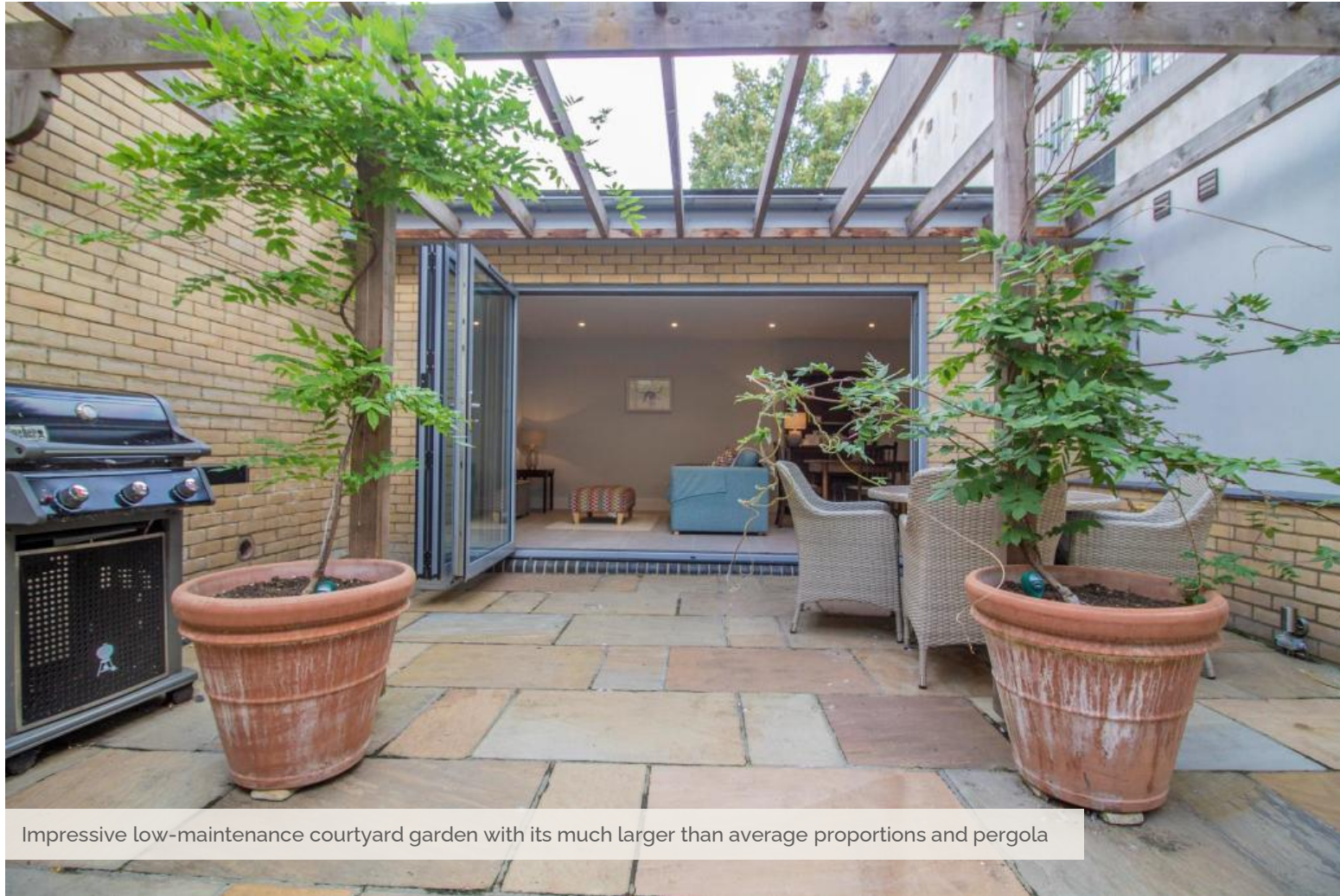
Impressive low-maintenance courtyard garden with its much larger than average proportions and pergola