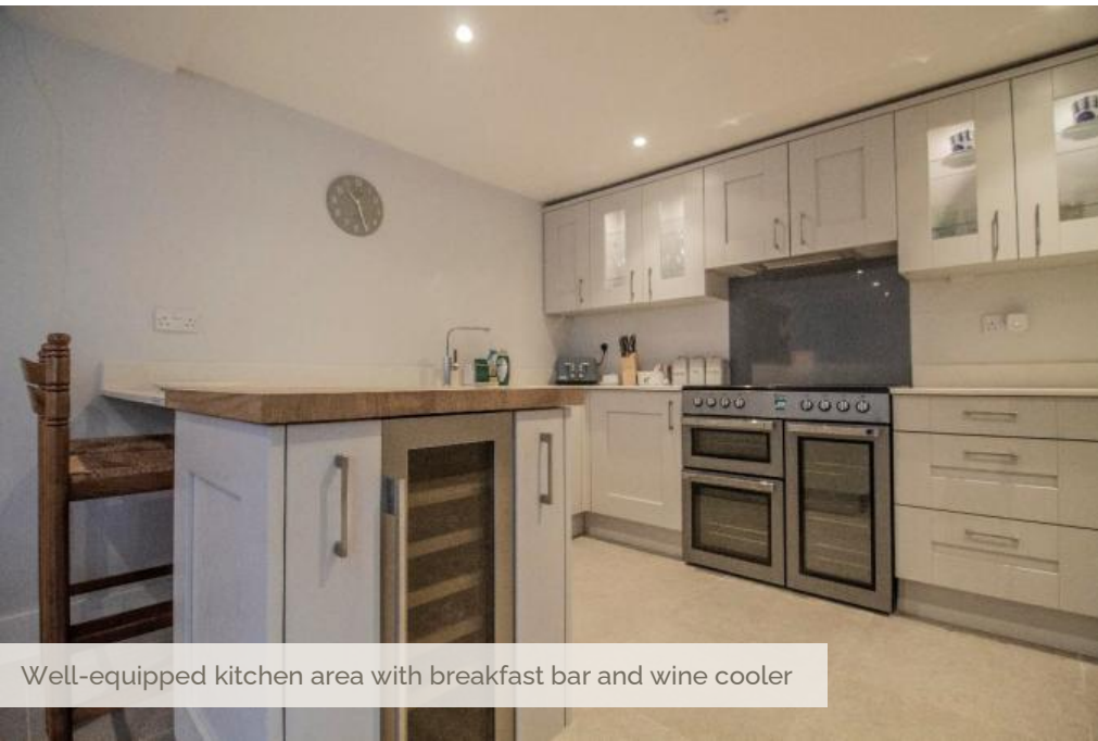
Well-equipped kitchen area with breakfast bar and wine cooler