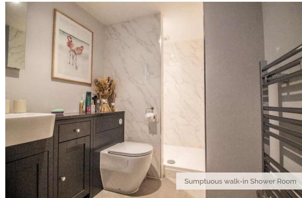
Sumptuous walk-in Shower Room