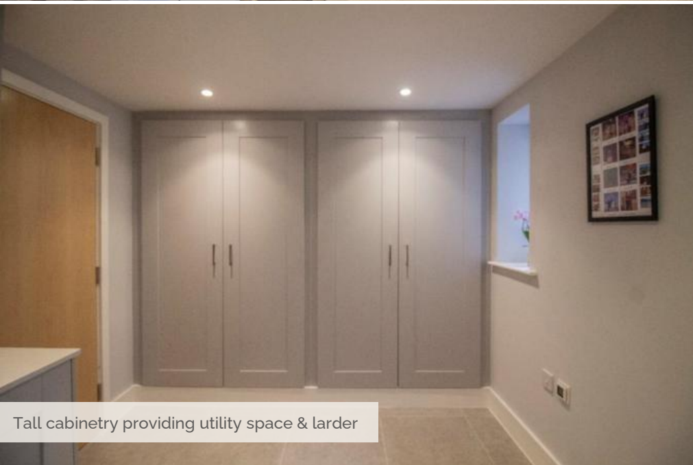
Tall cabinetry providing utility space & larder